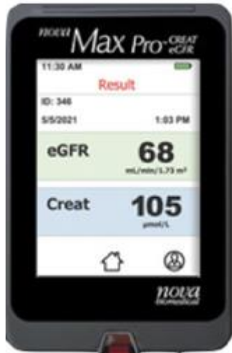
Point-of-care creatinine device & charger.