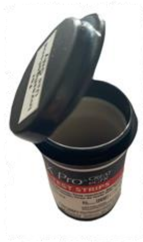
Point-of-care creatinine test strips.