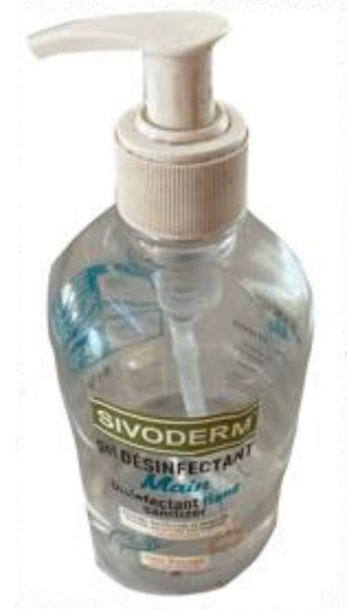
Antiseptic & cotton wool.